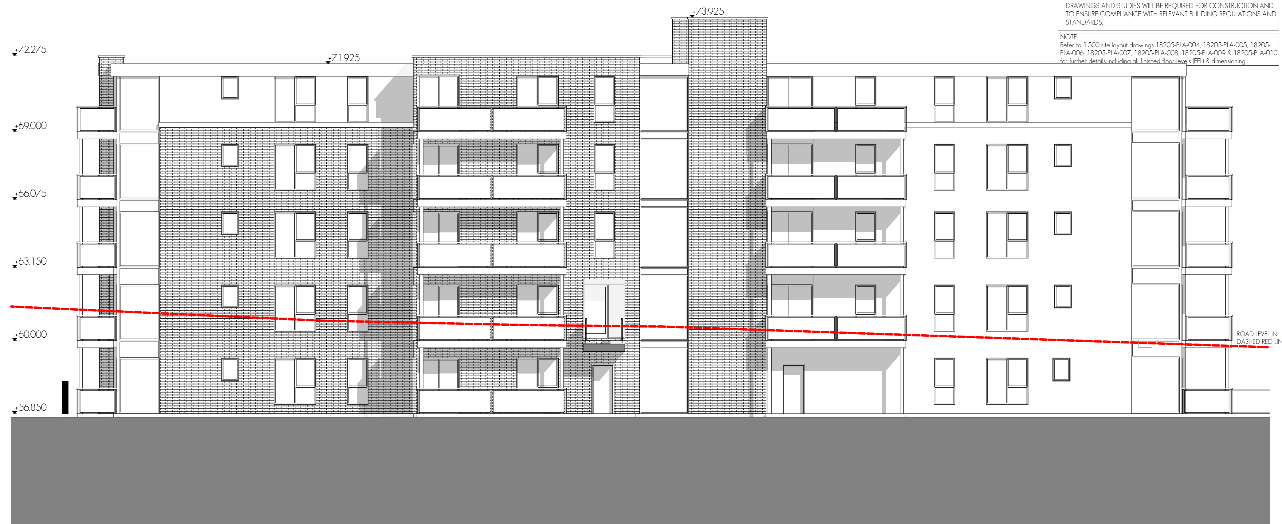
FRONT ELEVATION (NORTH) - BLOCK D 1:100