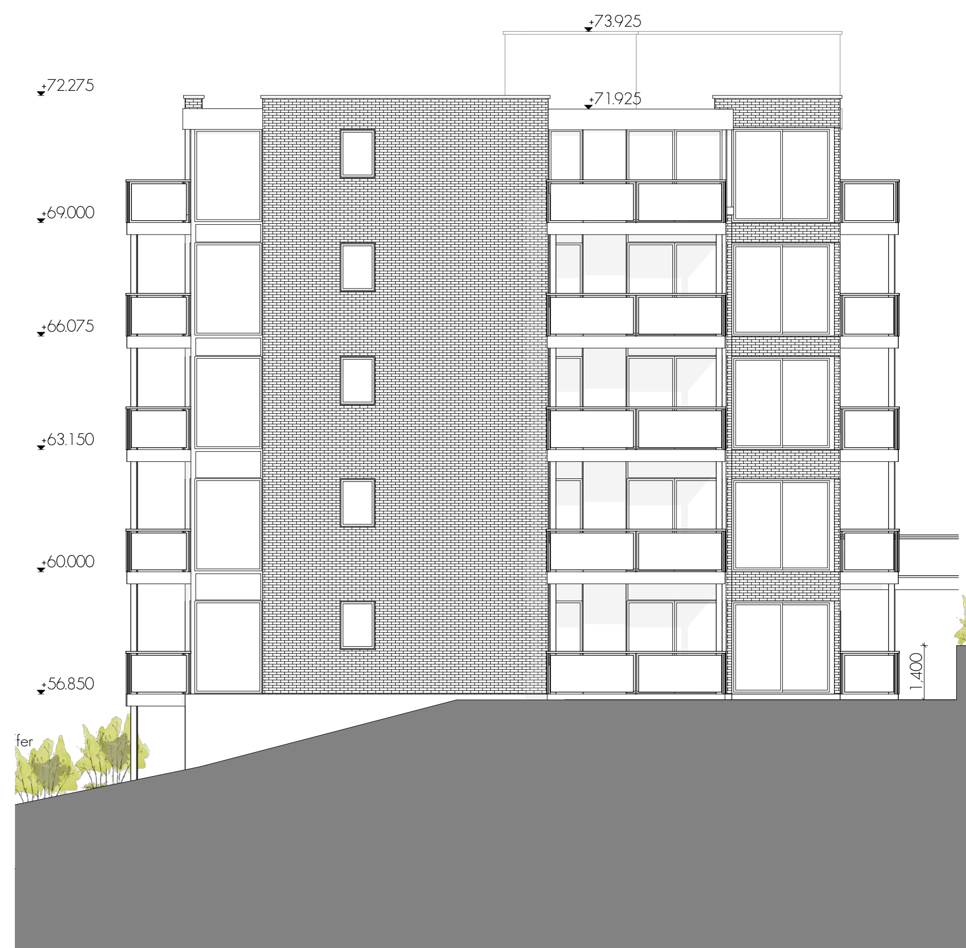
SIDE ELEVATION (EAST) - BLOCK D 1:100