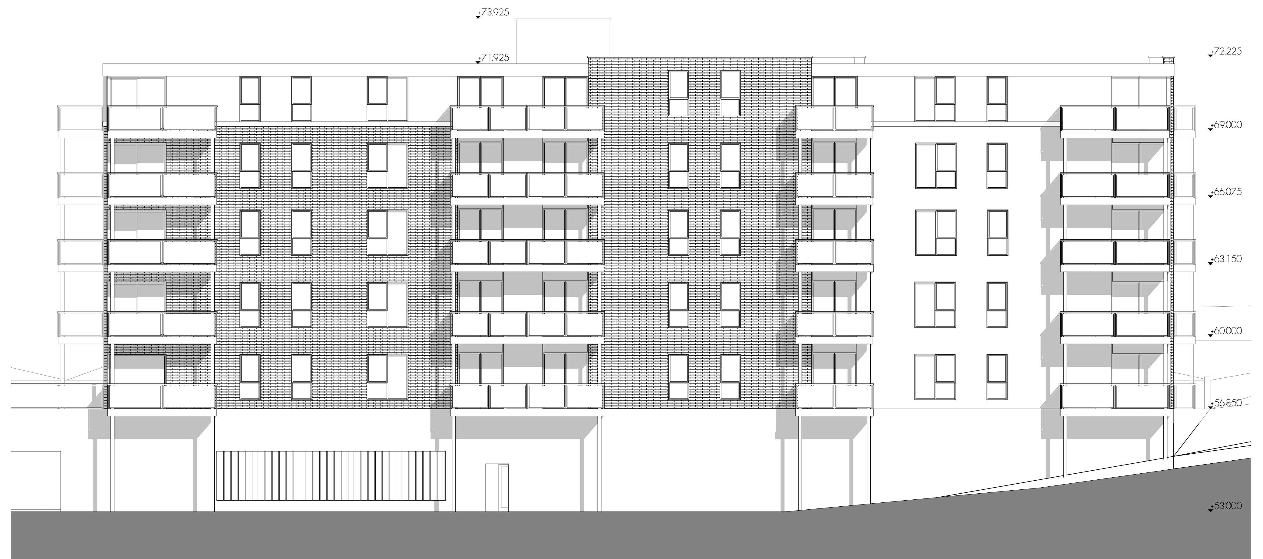
REAR ELEVATION (SOUTH) - BLOCK D 1:100

NOTE Refer to drawings 18205-PLA-118/119 for Keyplan